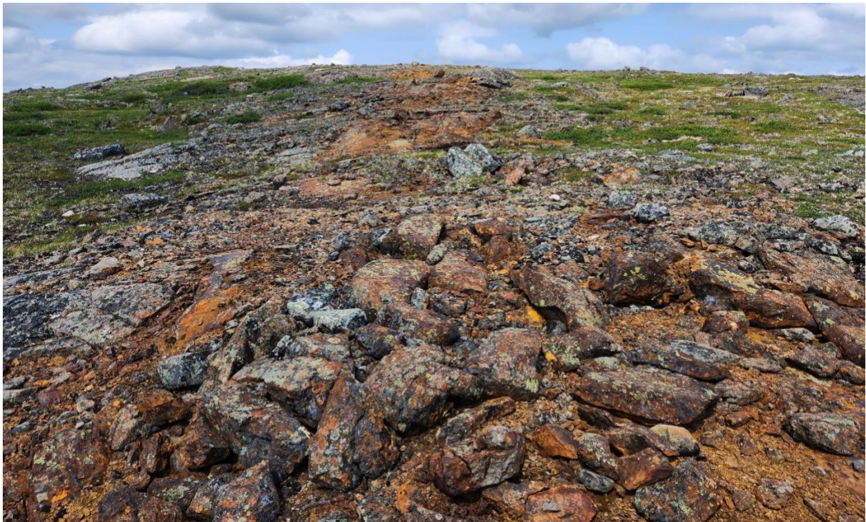
Figure 2: View from the bottom of Nickel Hill looking up towards a new drilling discovery. Thin glacial till obscures bedrock with bolder-train/subcrop indicating proximal source of continuous magmatic-nickel-sulfide zone. The Nickel Hill area continues under till cover for approximately 250 metres and largely remains untested.

VW23-04 and VW23-05 are characterized by lightly disseminated to net-textured and semi-massive mineralization. Zones with accumulate semi-massive to massive sulphide veins are also observed throughout the mineralized intervals. VW23-05 contains a noticeable increase in chalcopyrite interspersed through the pyrrhotite. A relatively low abundance of visible pentlandite would suggest that pentlandite occurs as lamellae within pyrrhotite and chalcopyrite rather than “eyes” at the triple-junction boundary of pyrrhotite grains more common within massive ores. Detailed microscope and mineral chemistry will aid to determine mineralogical relationships.