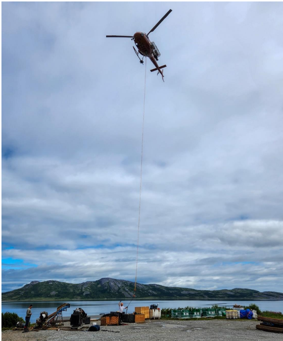
Figure 2: Mobilizing drilling gear at the Voisey's West project.

Preliminary targets have been identified from new geophysical modeling (see figure 1) and are planned to test VTEM conductors that have not been tested or exist beneath the historic drilling with 8 planned drill holes, total metres to be determined. Along with potential extensions of the No Baccy zone, the Company has also identified a jog, or bend in the main nickel bearing horizon located south of the All-About-It zone. This structure intersects the horizon that has shown nickel values of greater than 1% Nickel, up to 1.85% Nickel, as verified by the Company (see news release dated July 6, 2023).